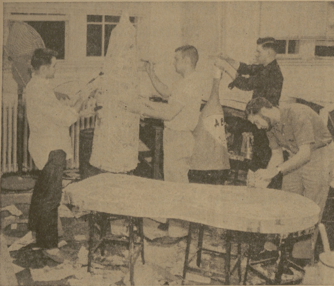
Decoration Preparations for Ball