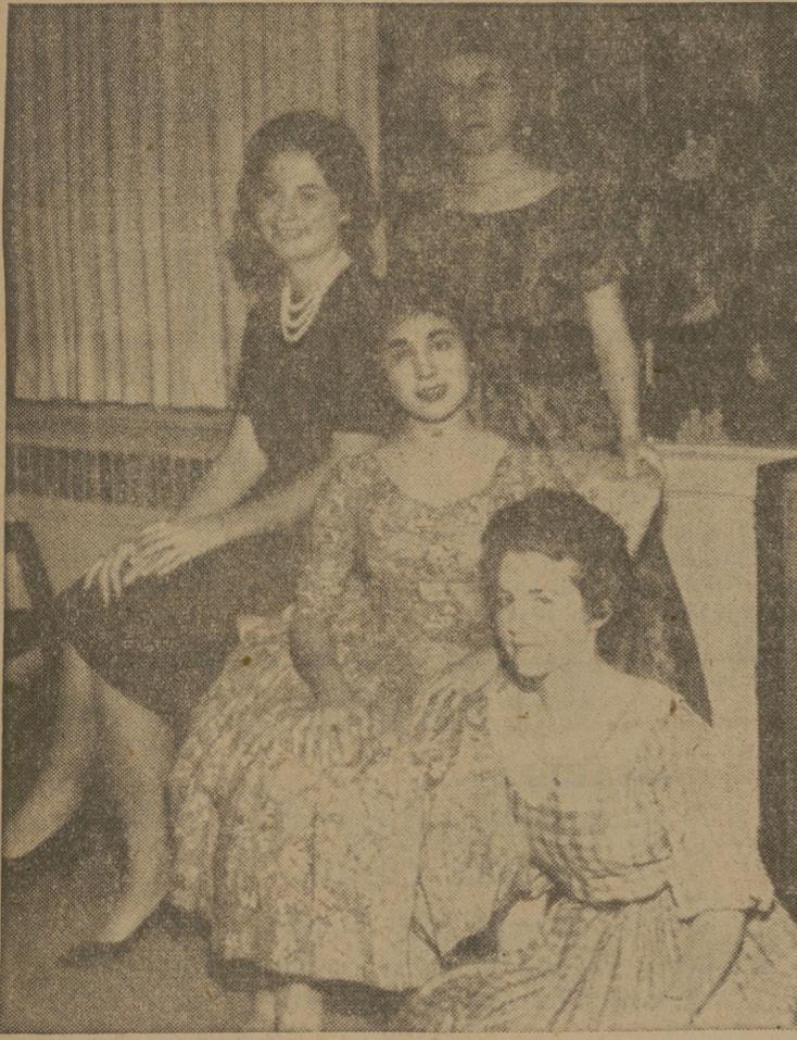
Come On To Tessieland