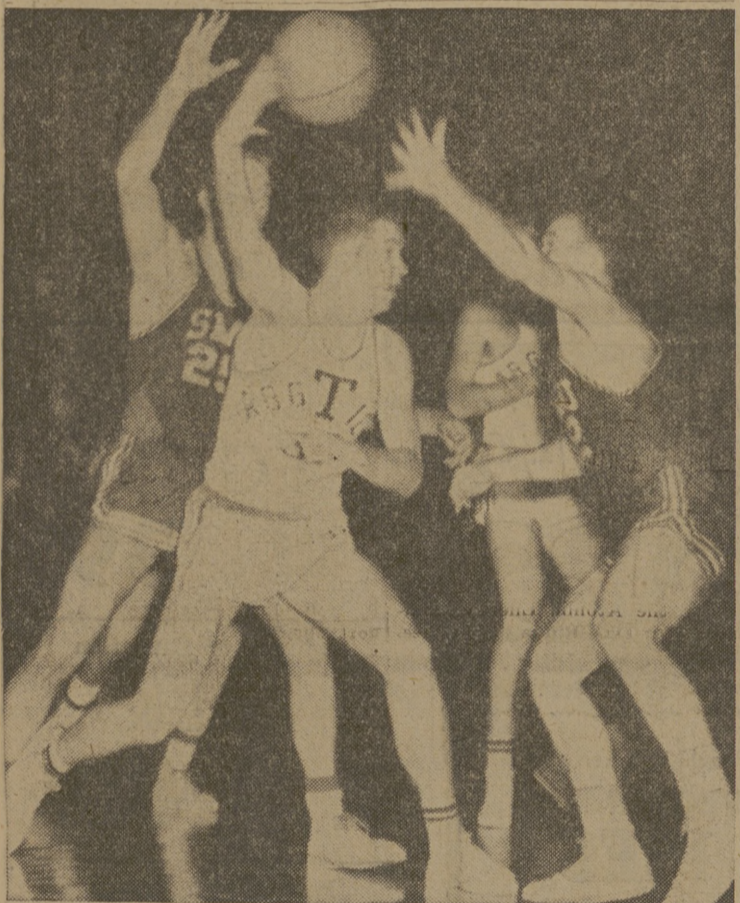
I've Got It!