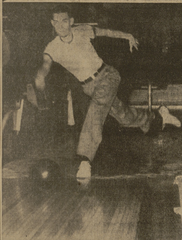
Down the Alley