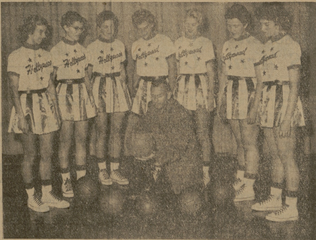
The Hollywood Queens

Although second in the Kentucky Derby of 1939 Chaldon was named horse of the year in 1939 and 1940.