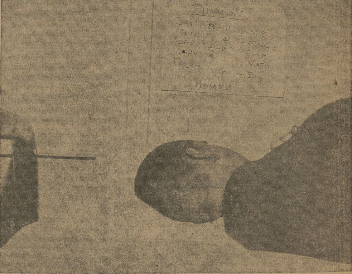
'I'll Feel Better Tomorrow' ... "and hit it then," says Fish Johnny Williams of B-FA

Area III is one of 10 vocational agriculture areas in Texas. It is composed of more than 100 teachers from 91 schools in a 21-county area which includes Brazos county.