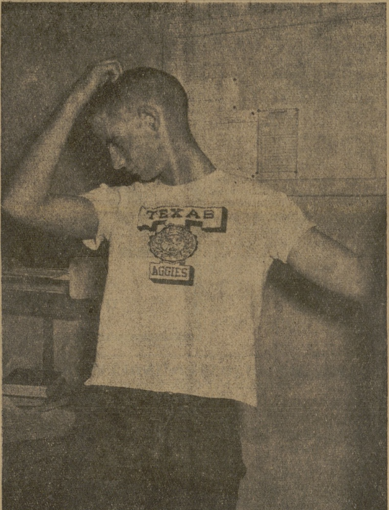
'I Guess It'll Wait' ... "got to have some sack sometime"

The snow stopped falling in most areas during the morning and skies started clearing at Perryton around noon.