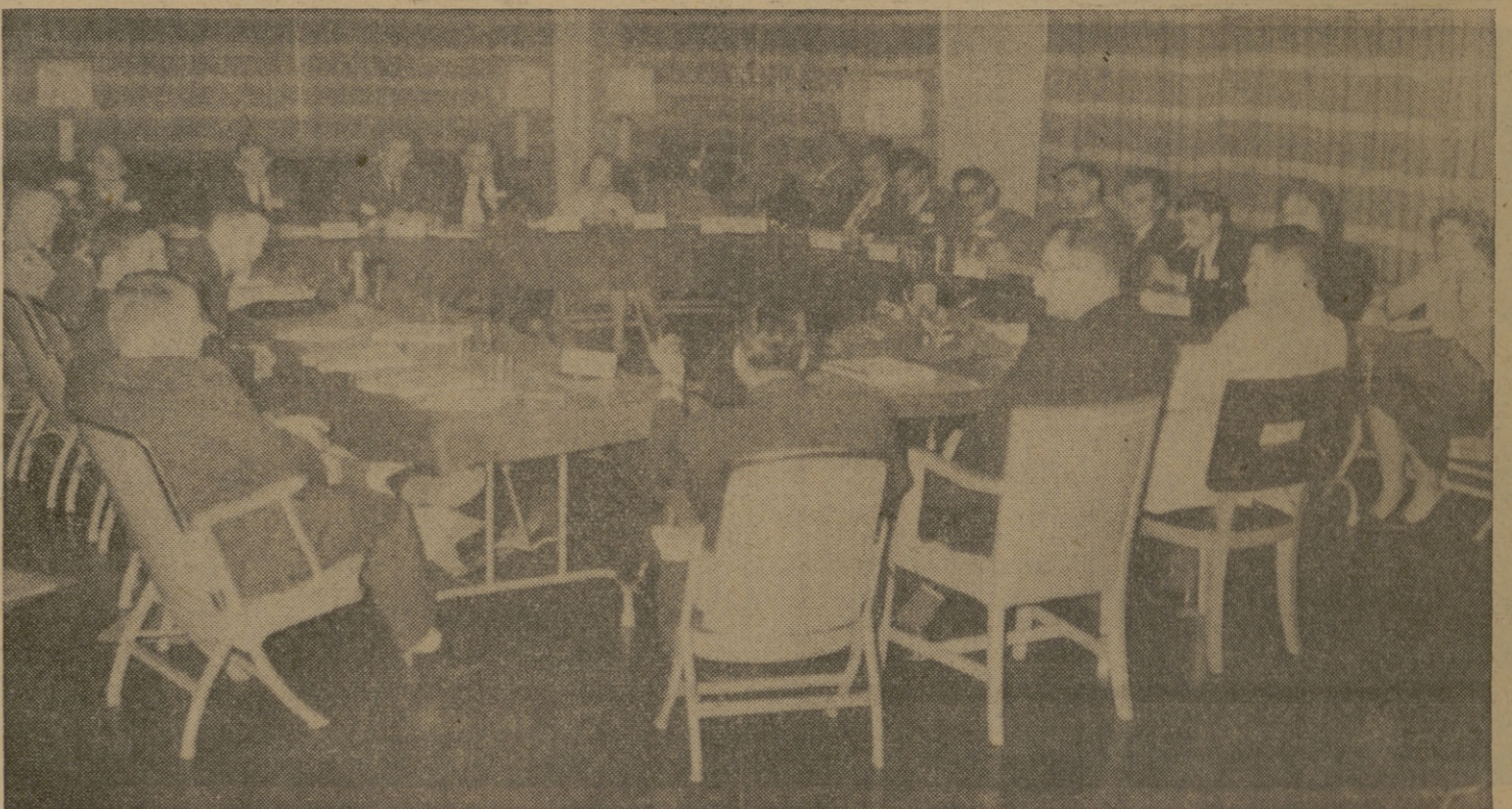
Battalion Staff