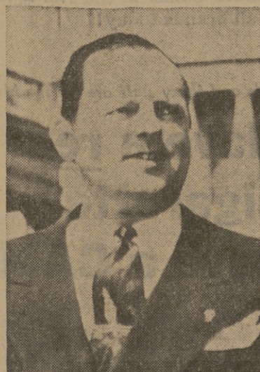
Congressman William Jennings Bryan, U. S. Representative from South Carolina "How Foreign Aid Can Increase Tension"