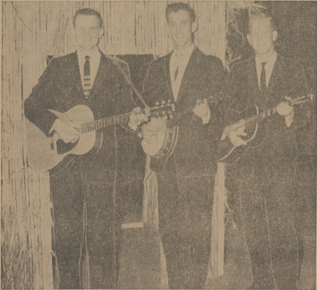
The Troubadours ... take top honors in Aggie Talent Show