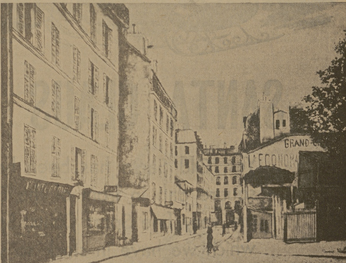
G716. Utrillo: Street