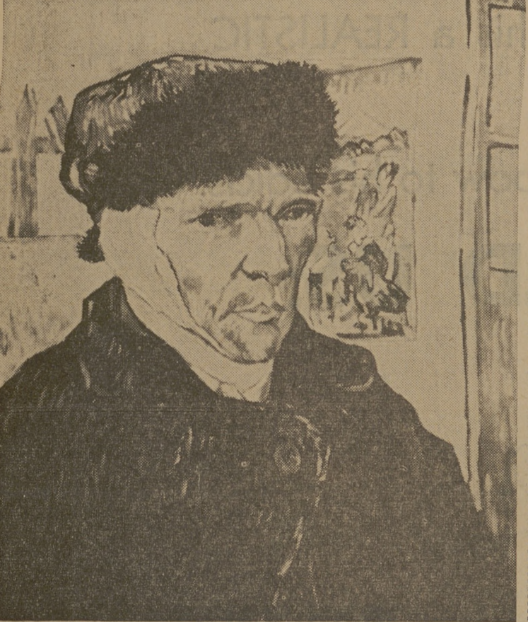
G462. Van Gogh: L'Homme a L'Oreille