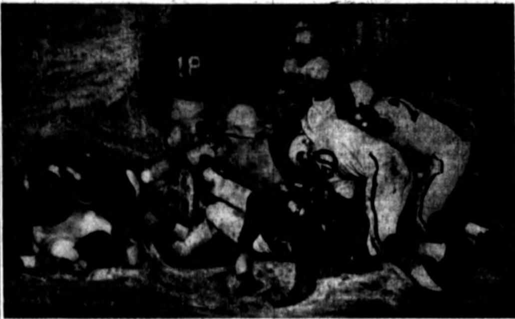
The Battalion ← College Station (Brazos County), Texas Wednesday, October 29, 1958 PAGE 3