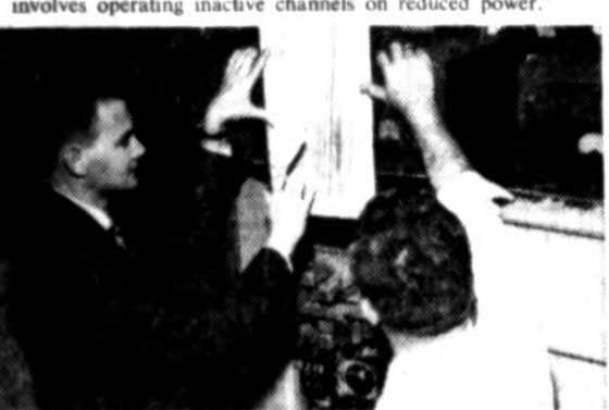
"1:30 p.m. After lunch, I take a company car out to the transmitter tower site. Here I check wiring and explain our olan to one of our mobile radio maintenance men.