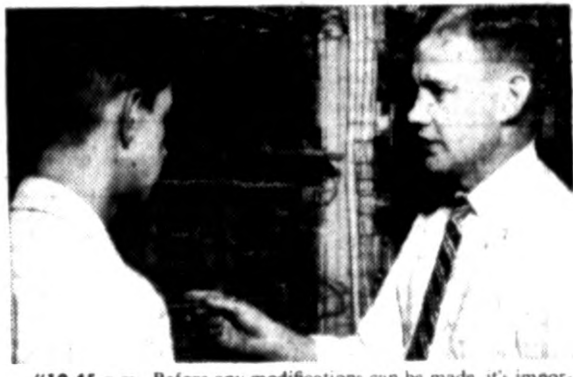
"10:45 a.m. Before any modifications can be made, it's important that I check apparatus and wiring options. That's what I'm doing here at the Remote Control Terminal equipment.