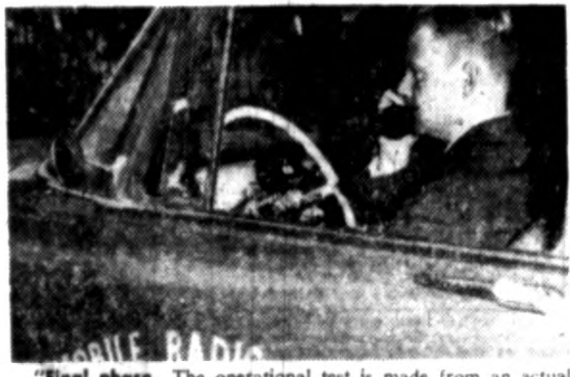
Final phase. The operational test is made from an actual mobile radio unit. I'll make test calls and monitor the channels from various points within the Pittsburgh area."

"See what I mean? I really get to 'carry the ball." Soon I'll be taking a special course in advanced electronics at Bell Labs - a great opportunity. As I said -I like my job."