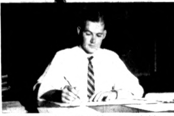
"8:30 a.m. I'm at my desk applying a new method for overcoming interference on Pittsburgh's mobile radio channels. It involves operating inactive channels on reduced power

"I'm a radio transmission engineer for Bell Telephone Company of Pennsylvania. My work is interesting and full of variety, and I get all the responsibility I can handle. Have a look at today's assignment, for example - and see for yourself."