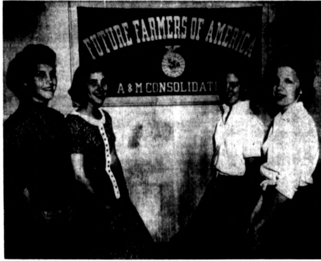
FFA SWEETHEART NOMINEES