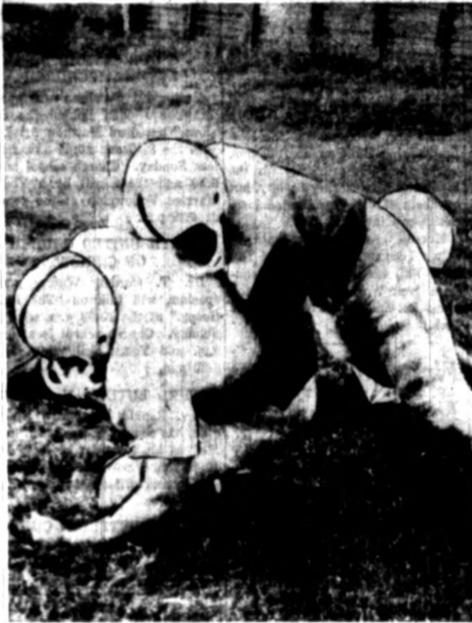
Riding Imitation Turtles

Crandall's homer with two out in the sixth was the only hit off the Yanks' 21-game winner until Joe Adcock sliced a pinch single to left with two gone in the ninth. Then Mickey Mantle gathered in Red Shoendienst's fly to center for the final out, the short reign of the Braves had ended.