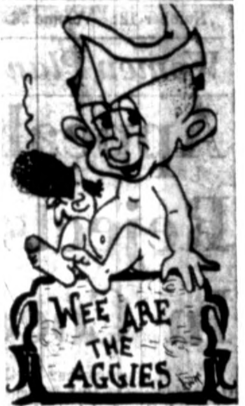
We Aggies like to read about Wee Aggie. When a wee one arrives, call VI 4-410 and ask for the Wee Aggie Editor.

Mother's Helper: Small girls think ironing is glamorous! Start them off by letting them iron dish towels and other straight pieces.