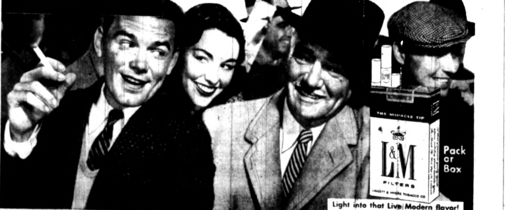
Light into that Live Modern flavor!

DON'T SETTLE FOR ONE WITHOUT THE OTHER! Change to L'M and get 'em both. Such an improved filter and more taste! Better taste than in any other cigarette. Yes, today's L'M combines these two essentials of modern smoking enjoyment - less tars and more taste - in one great cigarette.