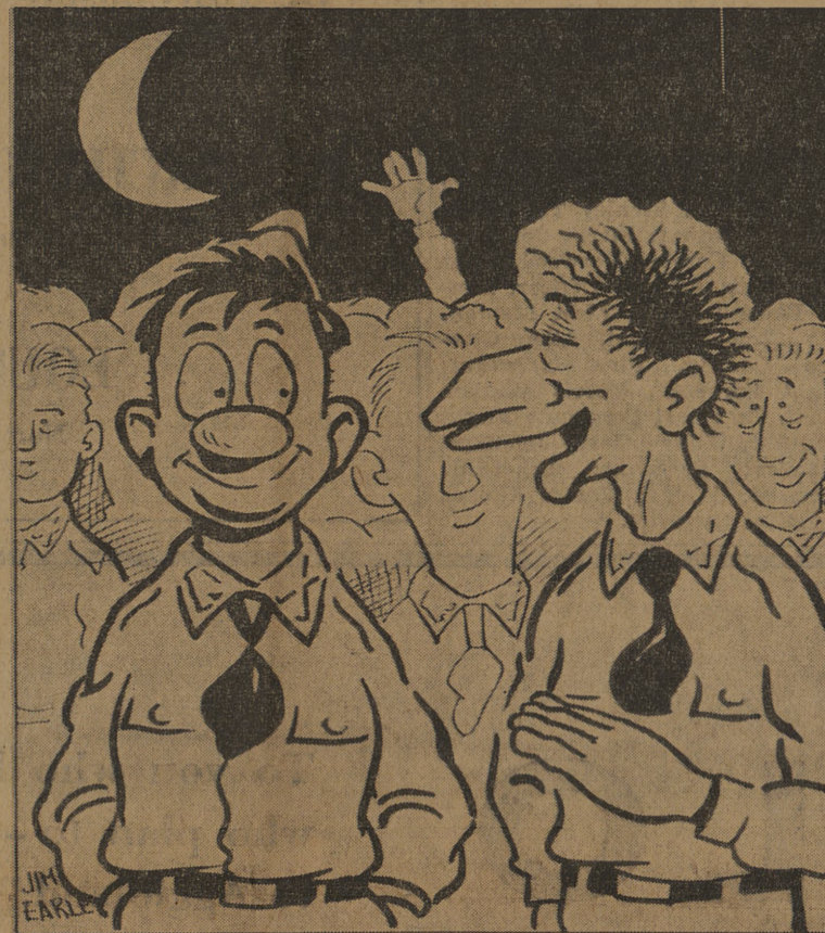
"I AIN'T TOO HOT ON YELL PRACTICE, BUT IT BEATS STUDYIN'!"

209 N. Main Bryan, Texas Phone TA 2-6105