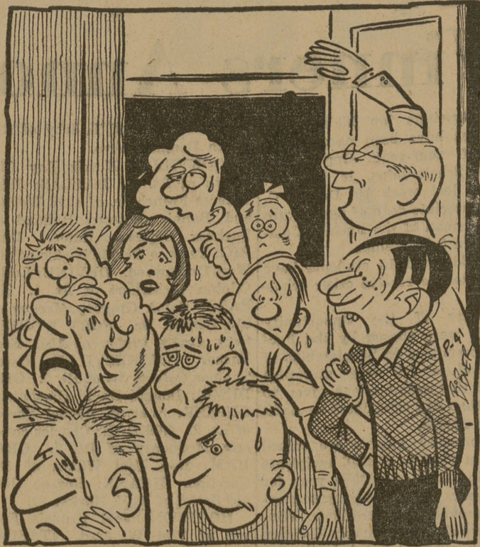
"JUST IN TIME TO INTRODUCE YOU TO BEAM—HE TEACHES A WONDERFUL CLASS I KNOW YOU'LL WANT TO TAKE."

In 1956, there were 57 extra-inning games in the Southern Assn. The longest game went 16 innings.