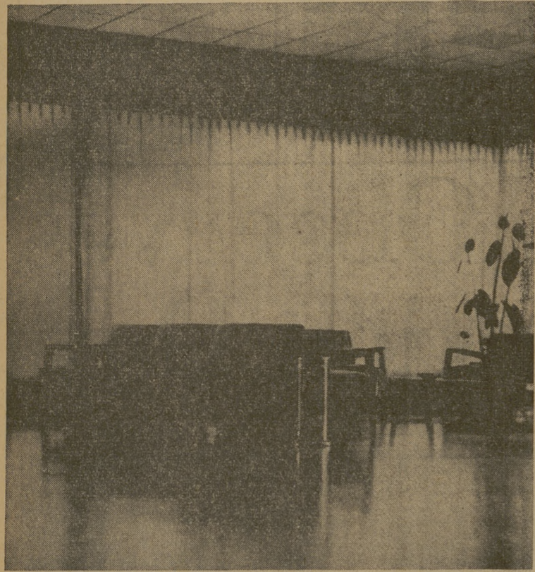
Interior Of The New Easterwood Terminal ... to be on display at open house Sunday