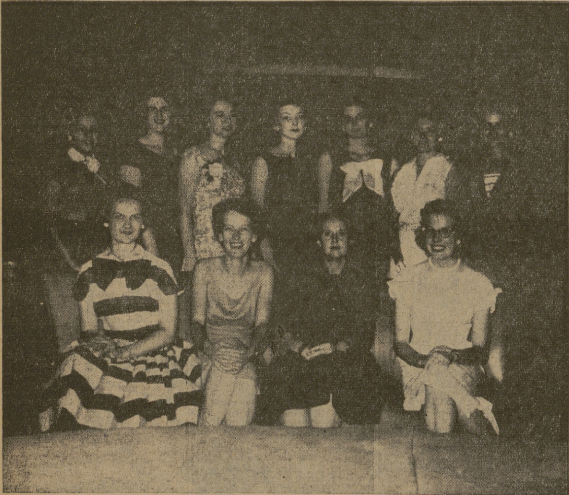
Wives Club Leaders