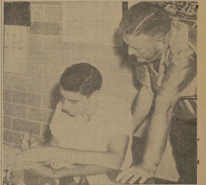
Top Texas Cager Signs With Aggies