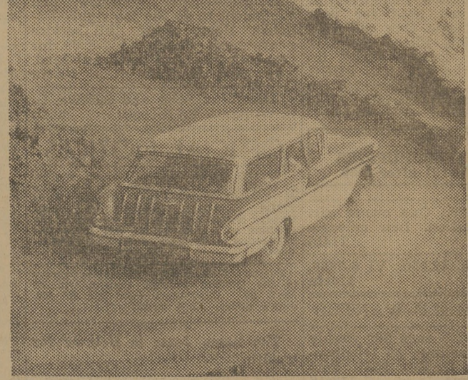
Grade Retarder gave extra braking on corkscrew descents;

Atlantic to Pacific and back, across the towering Andes, in 41 hours.