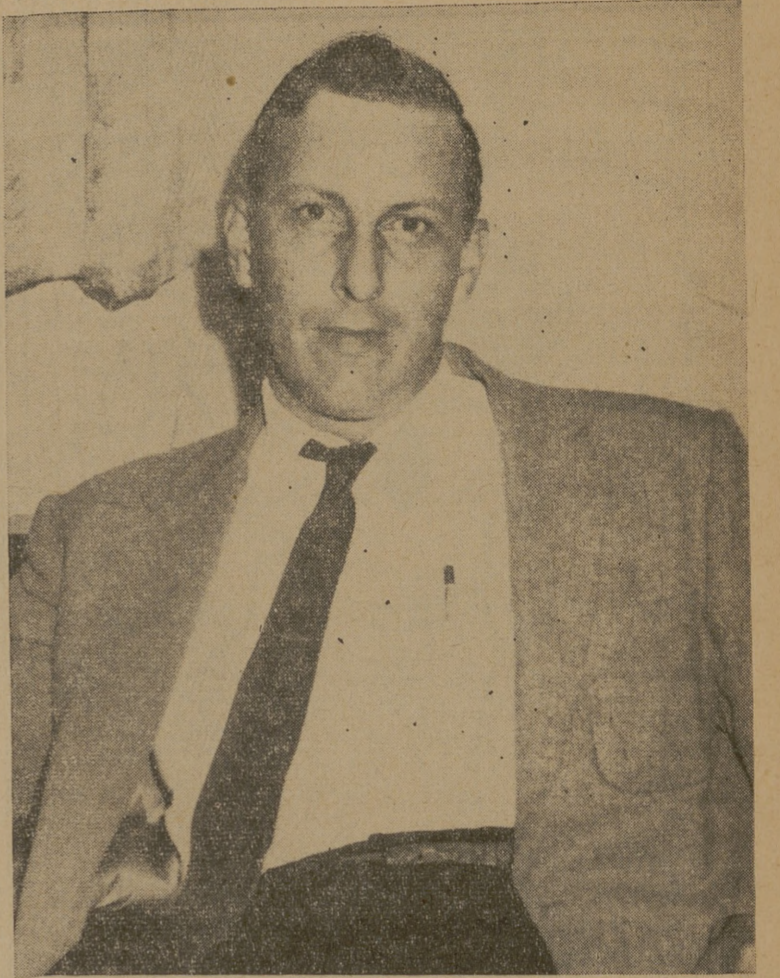
Battalion Staff Photo

Oliver suffered a broken left leg and possible internal injuries while the girl received a concussion and multiple fractures of both legs and an arm.