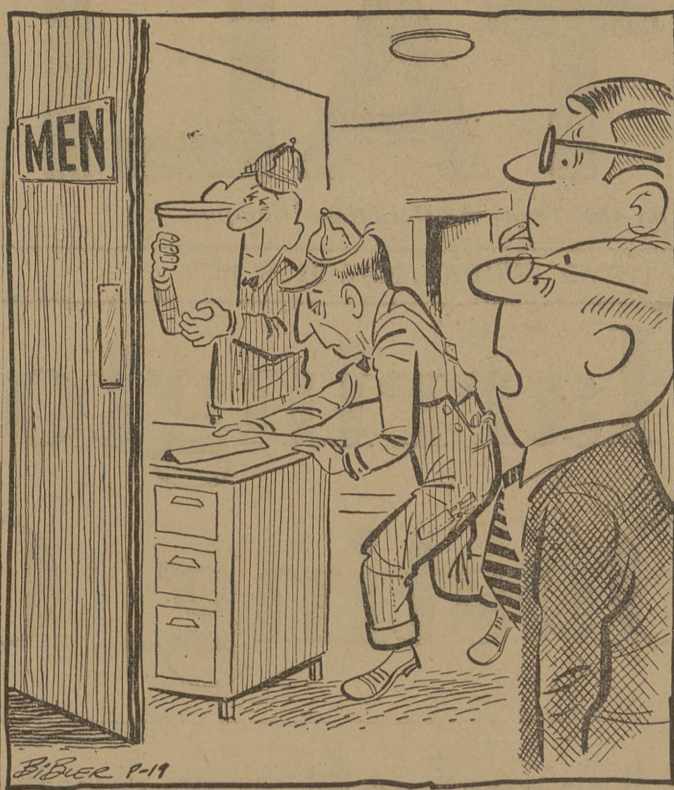
"WITH SO MANY NEW FACULTY COMING IN—YER LUCKY YOU EVEN GOT AN OFFICE."