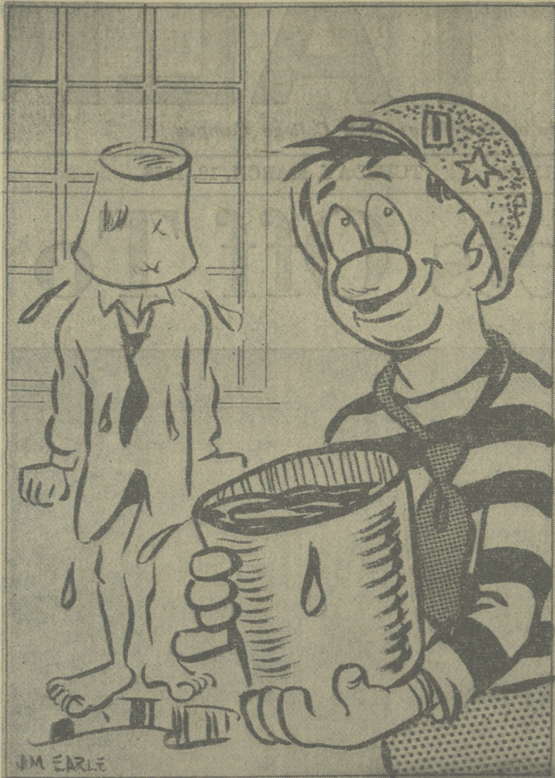
"I'm against coeducation, but I'd trade water fightin' for a good pantie raid."