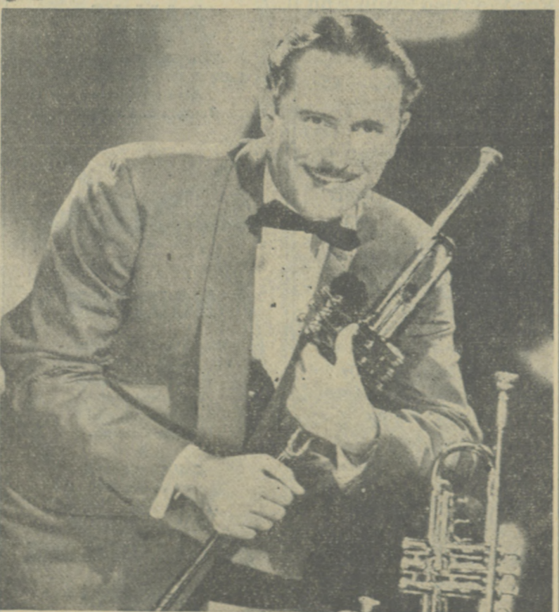
Music For Dancing

Tickets for the barbeque and dance are available from dorm council members, College View row representatives or from the office of Student Activities on the second floor of the YMCA.