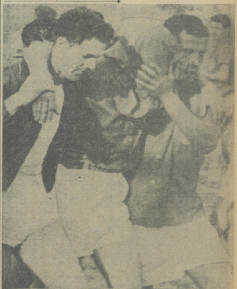
Injured Soccer Player