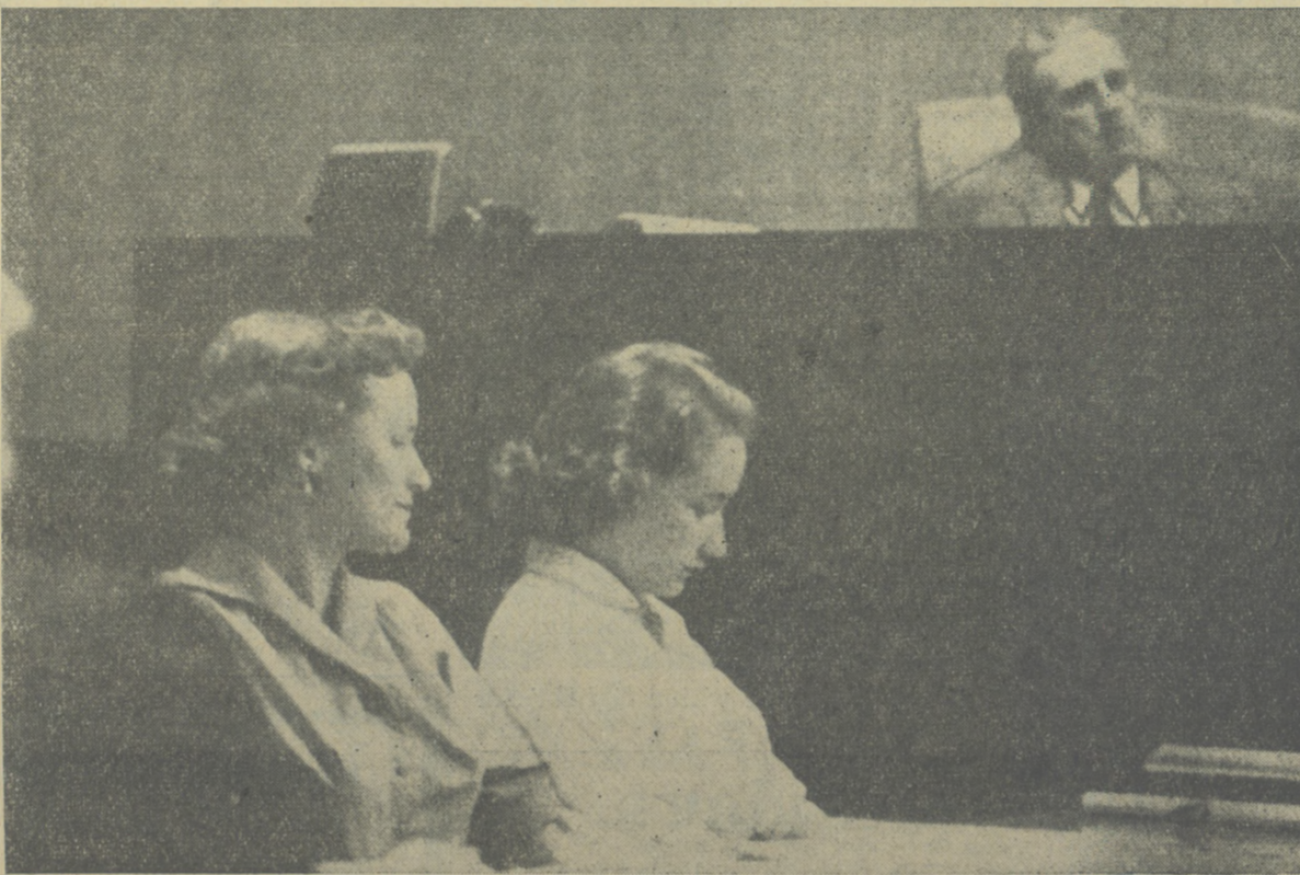
Plaintiffs Listen At Hearing