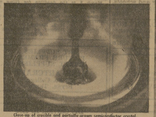
Close-up of crucible and partially-grown semiconductor crystal.