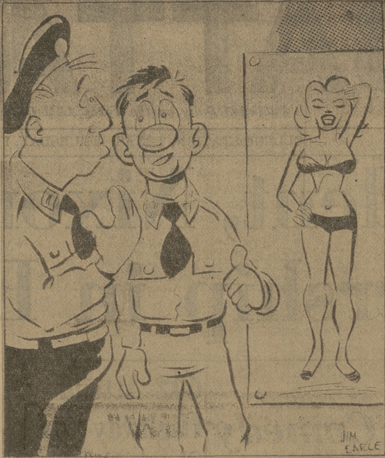
"But captain, sir—do you want me to take down a picture of my mother?"

The following job interviews will be held in the Placement Office: Friday Delhi-Taylor Oil Corporation, Dallas, will interview Chemical and Mechanical engineers. Pittsburgh-Des Moines Steel Company will interview Architectural, Civil, Industrial and Mechanical engineers. Plymouth Oil Company interviews Petroleum and Petroleum-Geological engineers. Price Waterhouse and Company will interview accounting majors.