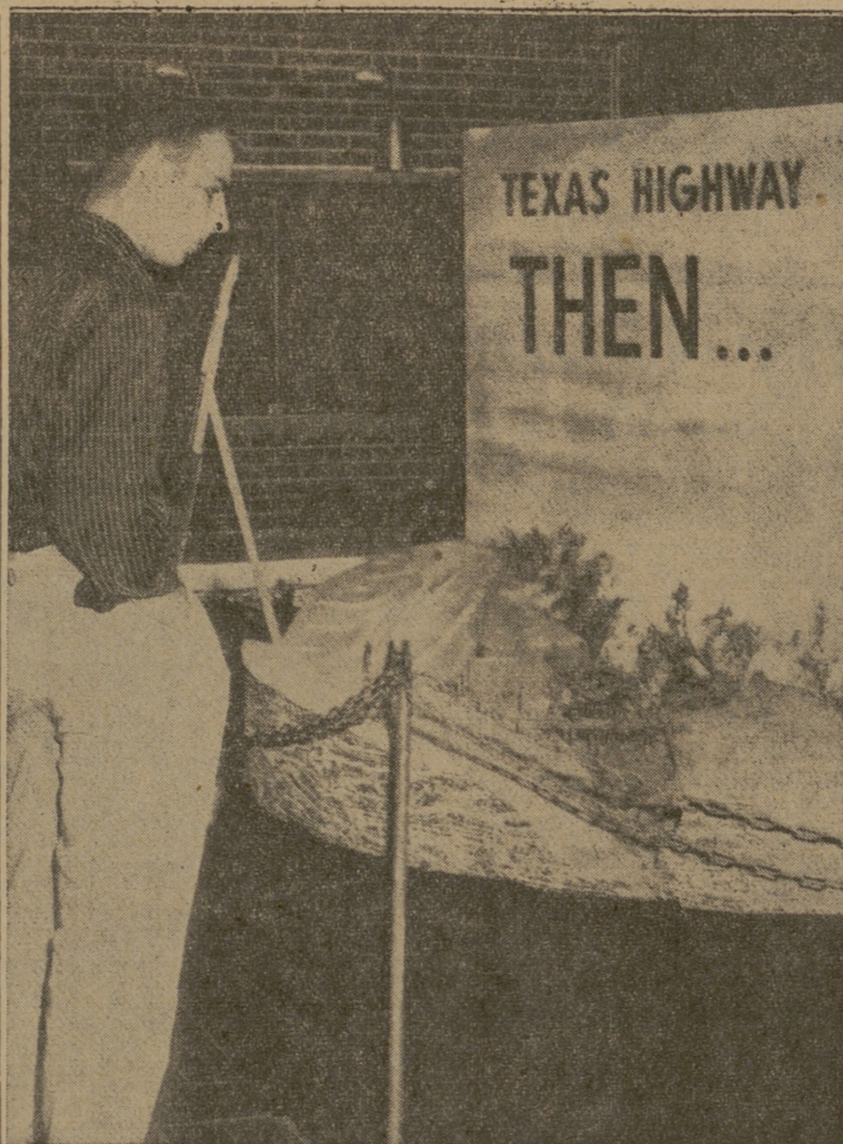
Roads Were Like This?

Might be the question this Ag is asking himself as he appraised Texas Highway Department's exhibit in the lobby of the Memorial Student Center this week. The exhibit shows Texas highways—then and now.