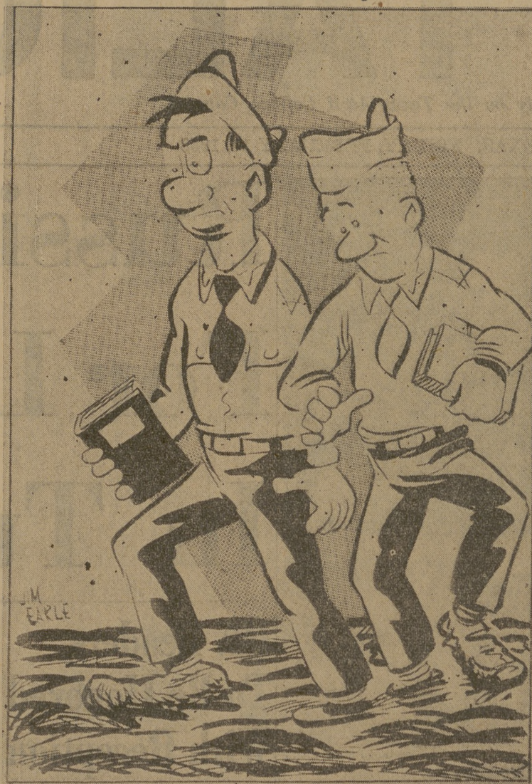
"Co-eds? What we need is sidewalks!"