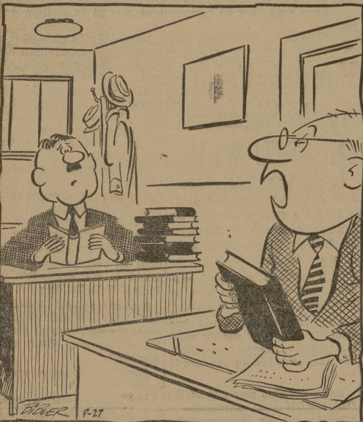
"I HAVE TWO BOOKS FOR MY COURSE. I GET ALL MY LECTURES FROM THE BEST ONE... THE LOUSY ONE IS MY REQUIRED TEXT."