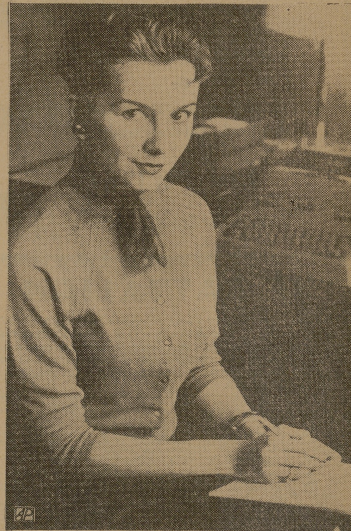
Highest Paid, Best Looking

Thirty-six young executives are due to attend the sessions to be held in the Memorial Student Center.