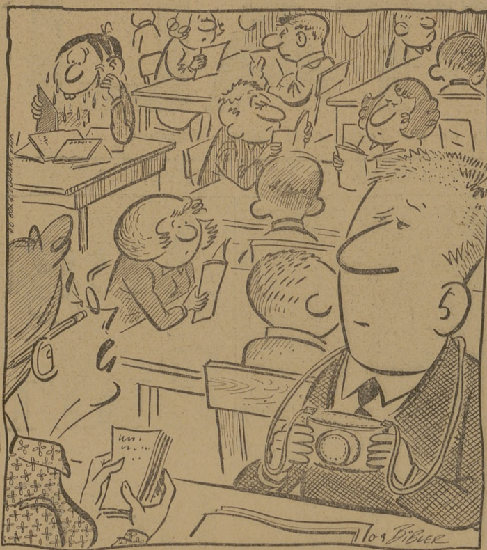
"PHOTOGRAPHY MAGAZINES? SOME STUDENT IN HERE HAS THEM ALL CHECKED OUT."