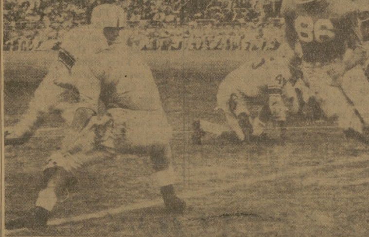
"All the King's Horses—"

However, the spunky little tailback stayed in action and tried one more line buck before Tennessee realized they couldn't penetrate the Aggie defense for a touch-down, so they would have to "kick