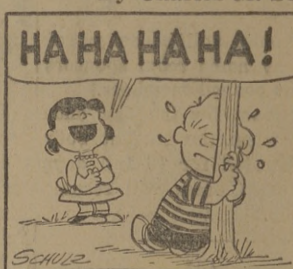
By Charles M. Schulz