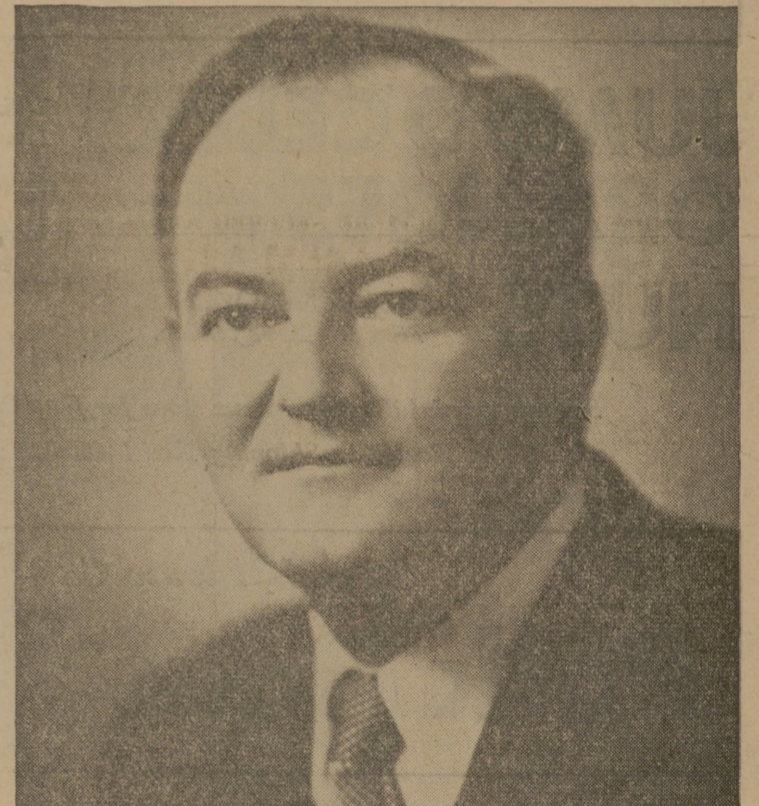
"How Can the Situation in the Middle East Affect the Rest of the World?"

FRIDAY, DECEMBER 13, 1957 — 2:00 P. M. M.S.C. BALLROOM