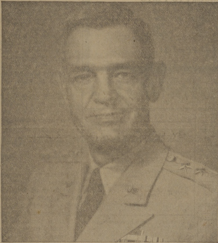
"Why Army Missiles in the Space Age?"

THURSDAY, DECEMBER 12, 1957 — 8:00 P. M. M.S.C. BALLROOM