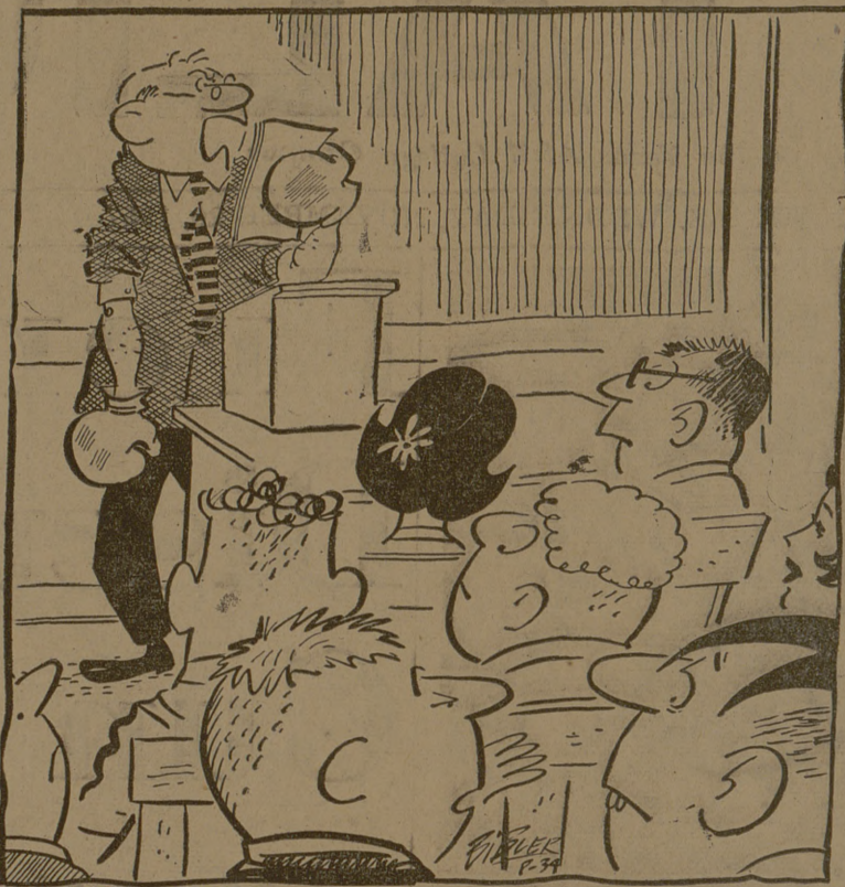
"BETTER PAY ATTENTION - HE'S IN A FOUL MOOD TODAY."