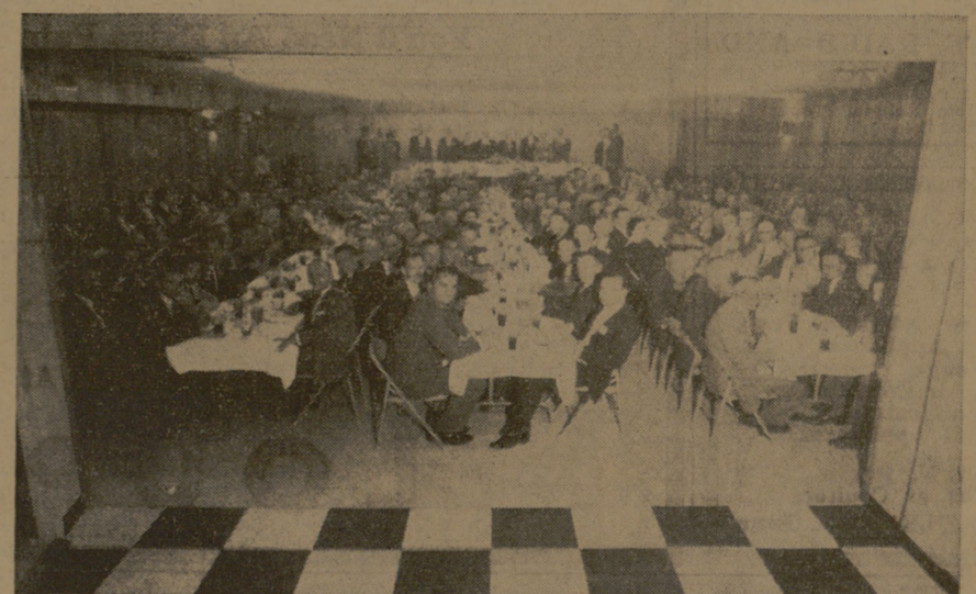
TRIANGLE BANQUET ROOM accommodating 20 to 250 people

FOR YOUR . . . . . Banquets, Conferences or Balls