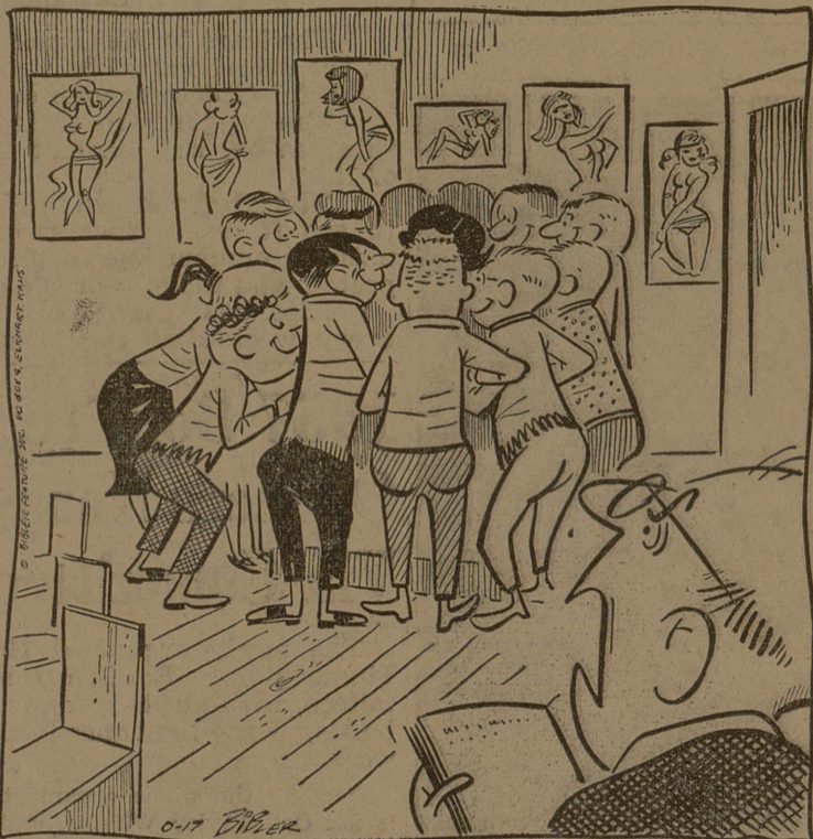
"YOU BOYS WILL FIND IT A LITTLE EASIER TO DRAW IF YOU STEP BACK FROM THE MODEL A LITTLE."