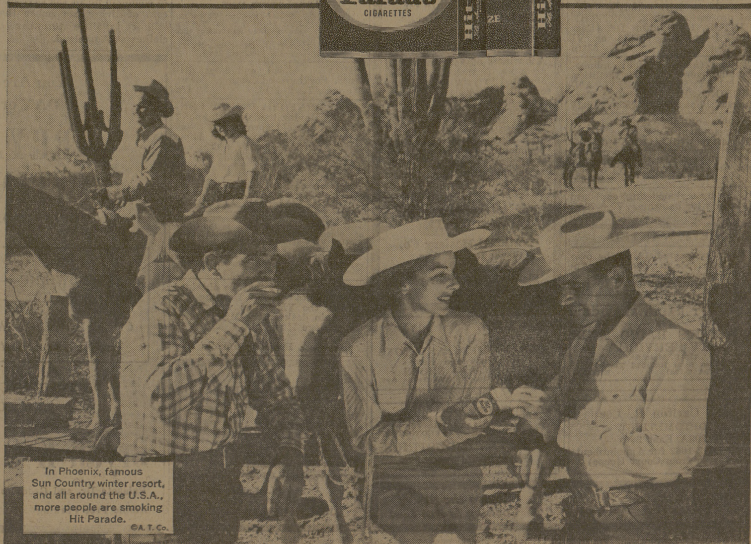
In Phoenix, famous Sun Country winter resort, and all around the U.S.A., more people are smoking Hit Parade. © A. T. Co.