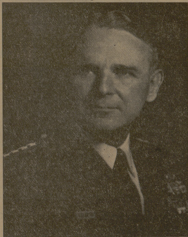
Gen. Maxwell D. Taylor

Gen Maxwell D. Taylor, chief of staff of the U. S. Army, will head a group of military dignitaries visiting here this weekend for the third annual Fall Military Day.