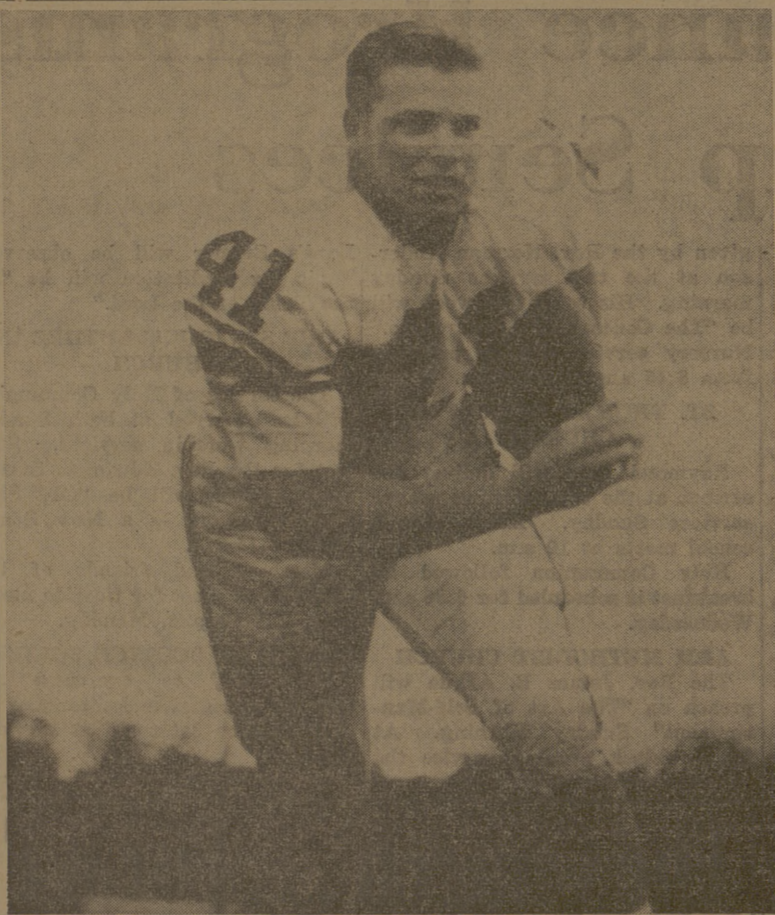
Arkansas's 1956 Offense Leader

Oklahoma over Kansas State —Whaddya want? Blood?