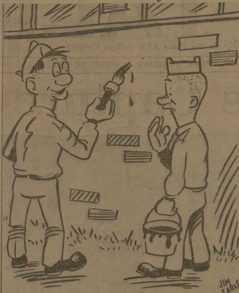
"WHICH WOULD BE MORE EFFECTIVE - 'YEA A&M!' OR 'YEA T.U.'?"