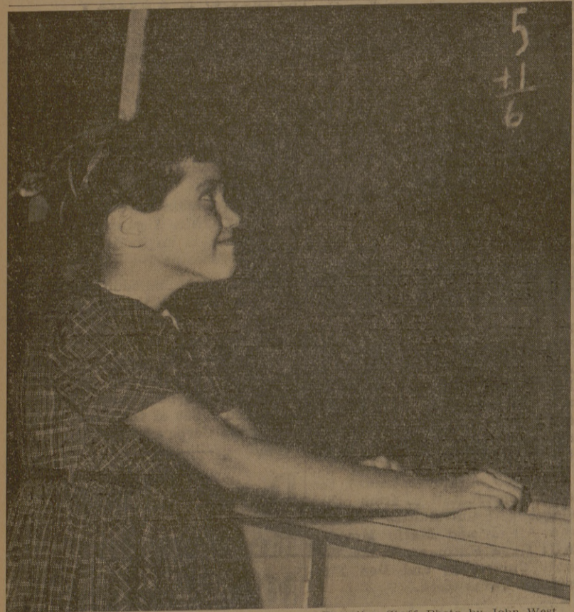
Battalion Staff Photo by John West

Remember that A&M will only be as good as each student can make it.