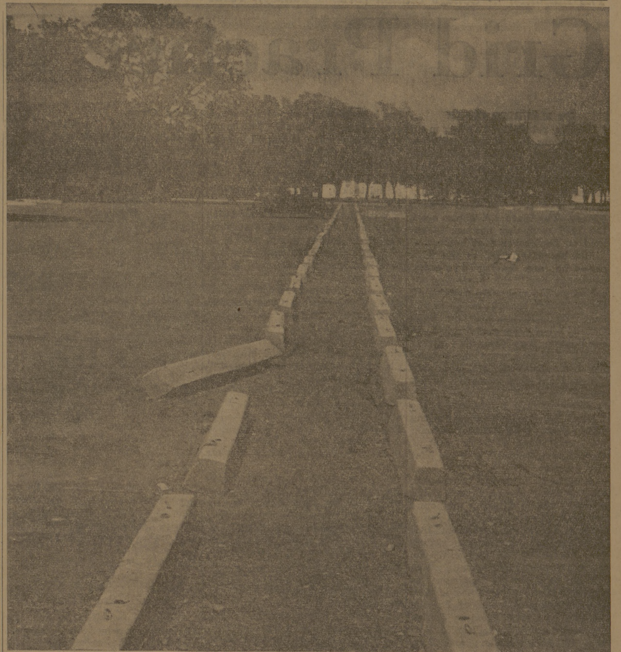
IT'S EMPTY NOW, but just wait another week. More cars than ever before will be pouring onto the campus. And the parking lot problem will be a major issue again.