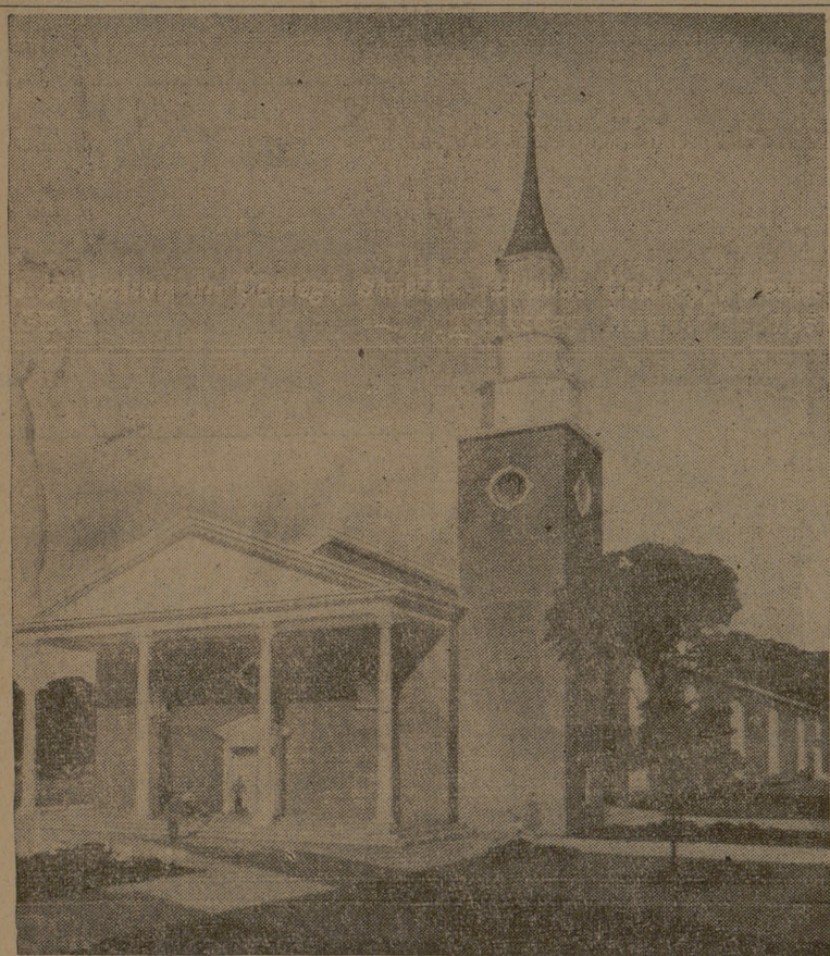
FOR FUTURE AGGIES —This architect's drawing shows the new St. Mary's Chapel as it will appear upon completion sometime next year. The chapel, located at the North Gate, will have a seating capacity of 650.

Beginning Sept. 15, two Sunday morning worship services, at 8:15 and 10:45, will be conducted. The Sunday school hour will remain the same, 9:30 a.m.