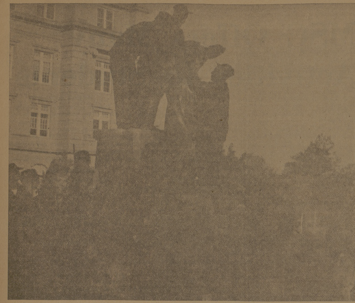
WASHING "SULLY" IS NOT AN OFFICIAL PART OF STUDENT ACTIVITIES, but is definitely a part of the students' activities. An unidentified group of freshmen prepare "Sully" for the weekend visitors.