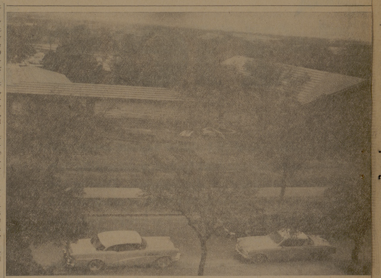
A&M'S NEW NON-DENOMINATIONAL CHAPEL was built for the students by the Former Student's Association. It is to be used for special services such as weddings, etc.