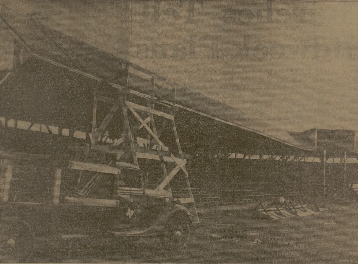
NEW ROOFING ON KYLE FIELD —Repair work in the shape of a new roof on the Kyle Field baseball stands nears completion. All repairs were made by A&M and the new roof offers better protection and a neater appearance to the park which had recently become shabby.

FOR LOCAL & LONG DISTANCE MOVING BEARD TRANSFER & STORAGE Ph. TA 2-2835 Agent for United