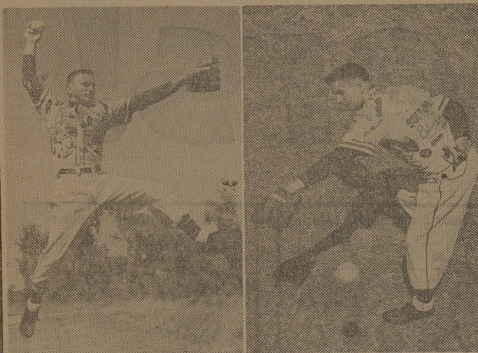
EDDIE FEIGNER, "KING" OF THE COURT

IT'S A FACT! Eddie Feigner, master of softball, hurls that ball at an unbelievable 104-miles-per-hour! Feigner really puts on a show... curves all but go around corners and his upshoot rises a foot or more! Fans and players alike profit by seeing this great show, for when the KING-AND-HIS-COURT play softball you see softball at its BEST!