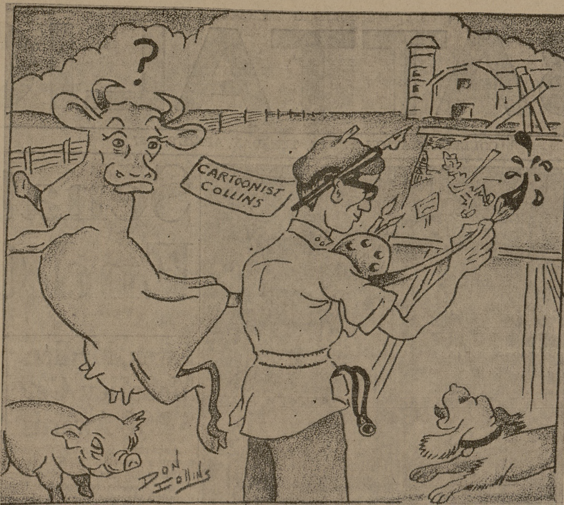
The Cartoonist As Seen By Himself

Members of the Veterinary School faculty will attend the seventh annual conference on "Diseases in Nature Transmissible to Man," to be held in Austin April 4 and 5.