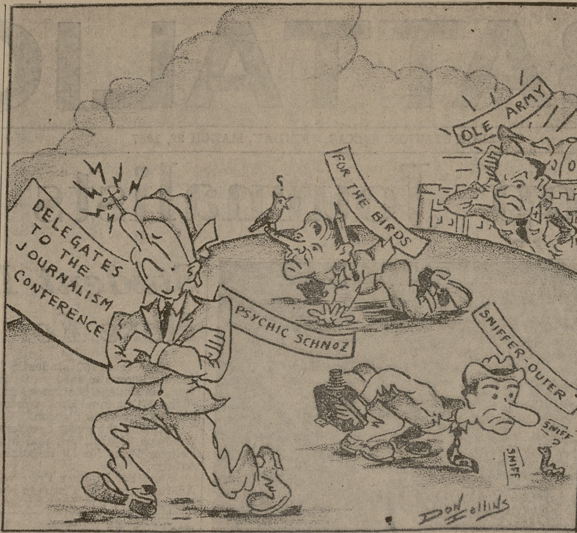
The Folks with a Nose for News?